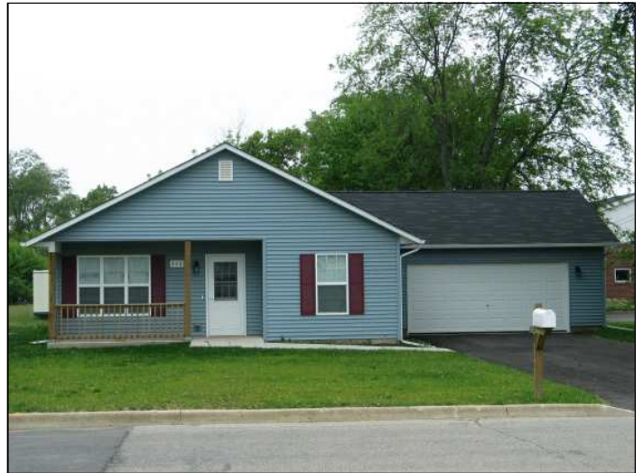
House #13—808 Eighth Street, Harvard, IL