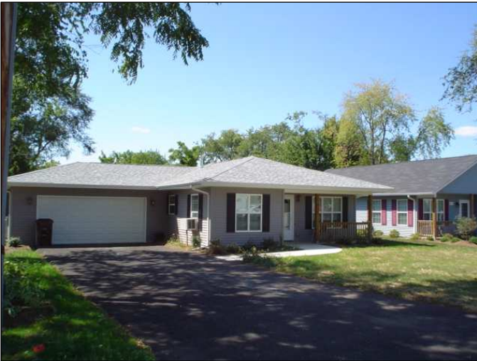
House #14—806 Eighth Street, Harvard, IL